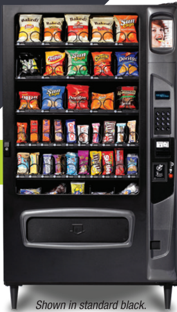
Shown in standard black.